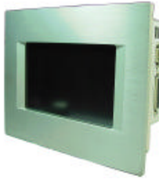
Aluminum-alloy Front Bezel (Silver color, i.e. Stainless steel color)